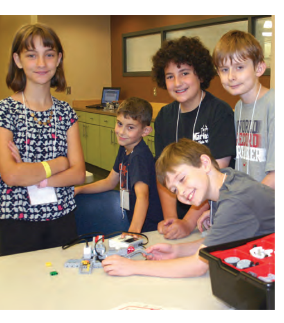
Cayuga's College for Kids and Teens

Do you like working with electric motors, cables, and switches to create basic machines? If so, join us and learn how to use weighted motors and recycled objects to build several contraptions that move. In the process you will learn about electricity, magnetism and how the two relate. For your final project you will develop a vibrobot of your own design based on the principles learned in class. Taught by Santiago Buigues.